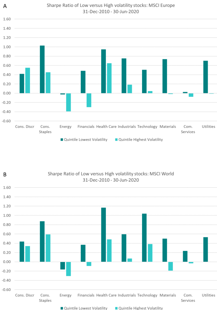
Exhibit 3: Sharpe ratio for the 20% least volatile stocks in each sector and the 20% most volatile stocks in each sector, calculated on 28 Jul 2020, based on data from 31 Dec 2010 through 30 Jun 2020. A: for stocks in the MSCI Europe index, based on monthly net returns in EUR. B: for stocks in the MSCI World index, based on monthly net returns in USD. Transaction costs were not included.

In exhibit 4, we show the Sharpe ratio, returns and volatility of each quintile of stocks behind the results in exhibit 3. Again, for all sectors with the sole exception of consumer discretionary, the absolute returns for the quintile of least volatile stocks were higher than for the quintile of their most volatile sector peers.